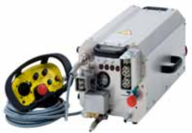
Pentpak 427 HF-power pack with Pentrunder autofeed system