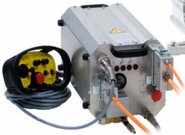
Pentpak 427 HF-power pack with Pentruder autofeed system