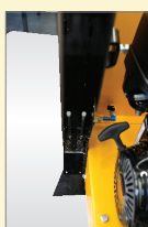
Heavy duty quick connection water system