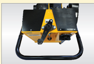
Handle locks in 2 positions for greater depth control