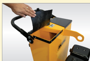
Rust proof internally painted watertank